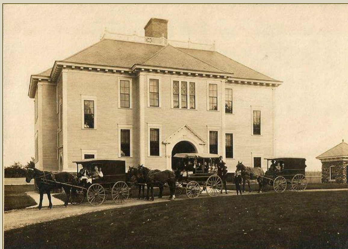
End of an Era of the One Room School House Boylston Consolidated School Received Students- December 1904 Boylston Center, Massachusetts BHSM Photograph Collection

This new brick East District School House would serve the students of the area until the building of Consolidated School in Boylston Center which received its first students on December 21, 1904. The remains of the East School can still be seen about 600 ft south of 385 Central Street.