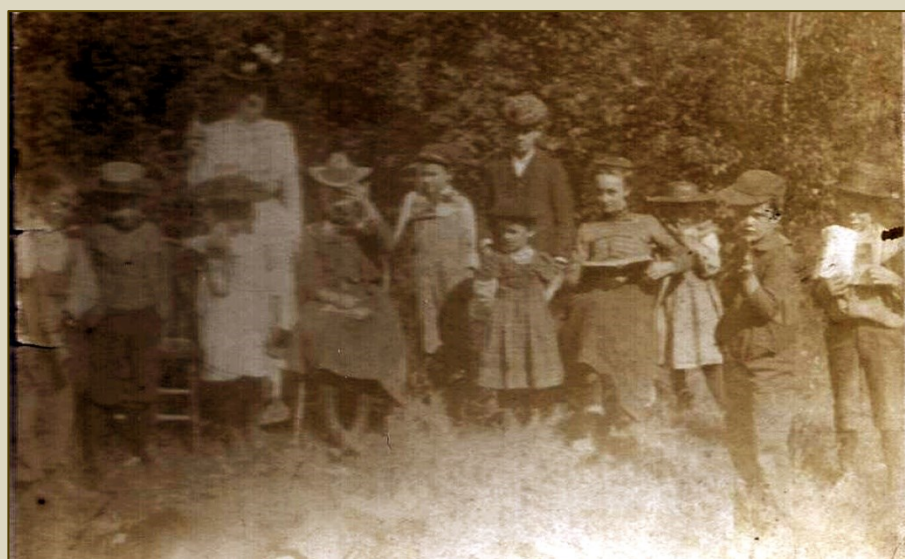
Students from East School Proudly Showing Textbooks