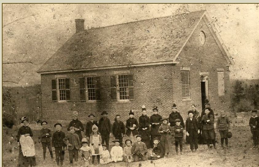
[Second] East District School House with Students and Teacher Located on Central Street

The East School House on Stiles Road served the area until 1851 when it was abandoned for a new East District School House constructed of brick which was built upon the northerly side of the new road leading to Northborough. 5